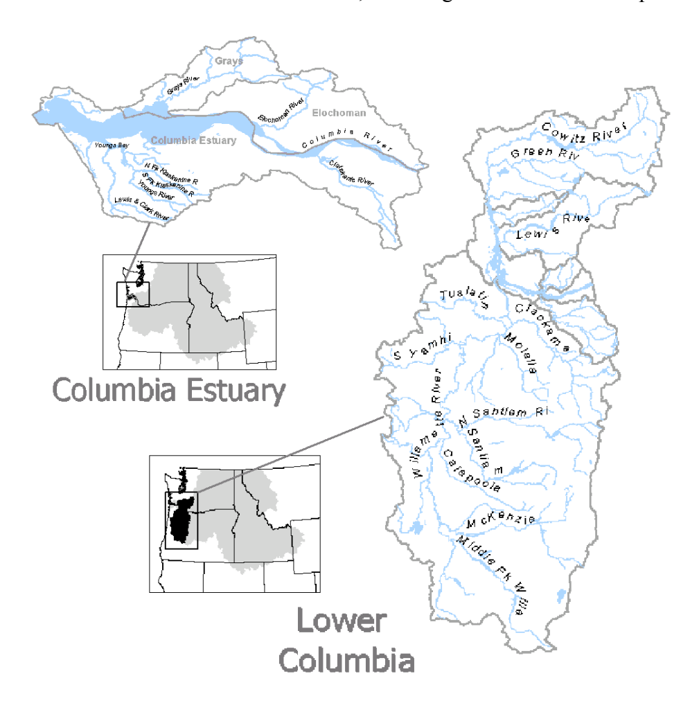
Figure 1. Lower Columbia and Columbia Estuary Provinces

The Lower Columbia and Columbia Estuary Provinces (Figure 1) are located in northwestern Oregon and southwestern Washington. These two provinces extend from Bonneville Dam to the Pacific Ocean, including the Columbia River plume.