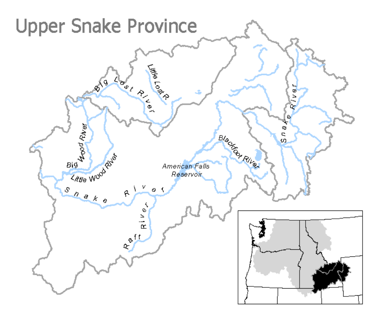
Figure 1. Upper Snake River Province

The Upper Snake River Province (Figure 1) is located in southeastern Idaho and western Wyoming. It includes the Snake River and all tributaries from Shoshone Falls to headwaters, all closed basins within the Columbia Basin east of Shoshone Falls.